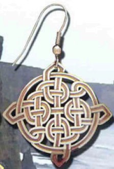
CE01NC Square Knot