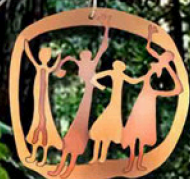
GD11BC 4 Dancing Women