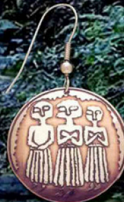
GD07NC Maiden, Mother & Crone