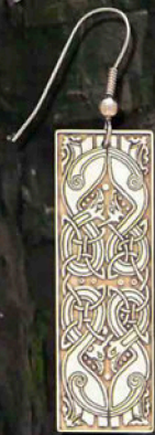
CE06NC Peacock Knot