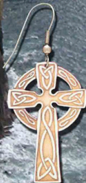
CR01NC Celtic Cross