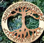
GD16NC Tree of Life