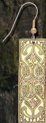
CE06BC Peacock Knot