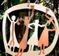
GD11NC 4 Dancing Women