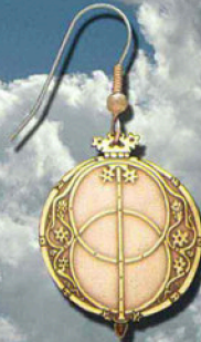
AR02BC Chalice Well