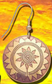
ID07BC Navajo Wedding Basket