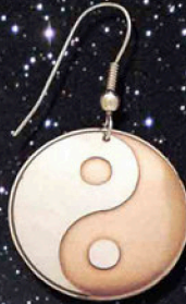
SS01NC Yin Yang