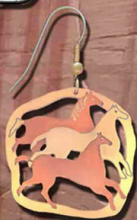
PI01BC Running Horses