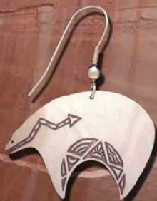
TO02NC Totom Bear