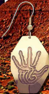
PG08BC Shaman's Hand