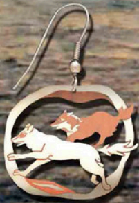
NA35NC Running Wolves