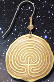
AR03BC Rocky Valley Maze