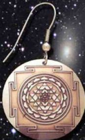
SS03NC Sri Yantra