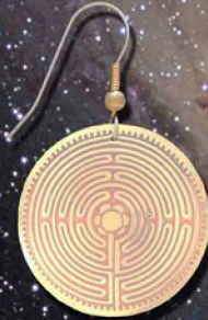
SS11BC Chartres Maze