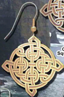
CE01BC Square Knot