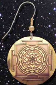
SS03BC Sri Yantra