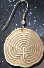
AR03NC Rocky Valley Maze