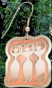
GD10NC 3 Dancing Women