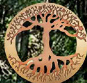
GD16BC Tree of Life