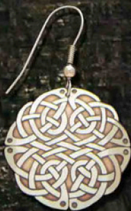
CE02NC Serpent Knot