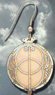
AR02NC Chalice Well