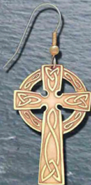
CR01BC Celtic Cross