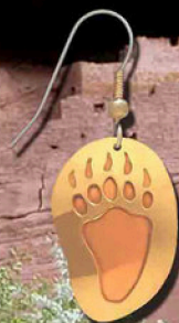
PP02BC Bear Print