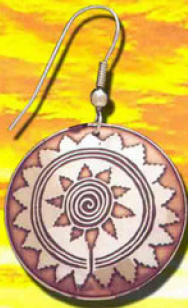
ID07BC Navajo Wedding Basket