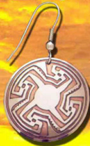
ID06NC Pima Basket Design