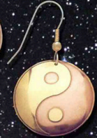
SS01BC Yin Yang