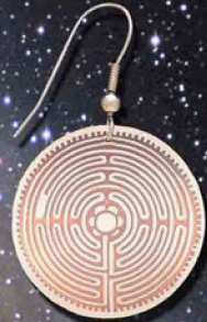
SS11NC Chartres Maze