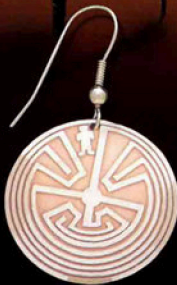
ID08NC Man In The Maze