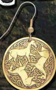
CE04BC Horse Knot