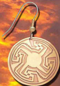
ID06BC Pima Basket Design