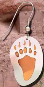
PP02NC Bear Print