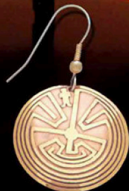
ID08BC Man In The Maze