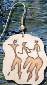
GD02NC Triple Goddess