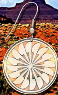
ID13NC Feather Shield