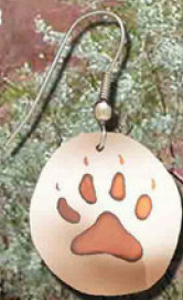
PP01NC Wolf Print