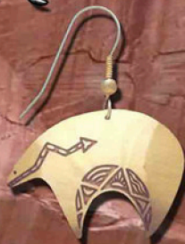
TO02BC Totom Bear