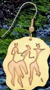
GD02BC Triple Goddess