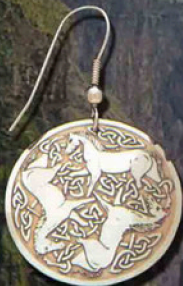
CE04NC Horse Knot