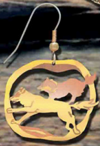
NA35BC Running Wolves