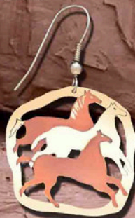
PI01NC Running Horses