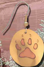
PP01BC Wolf Print