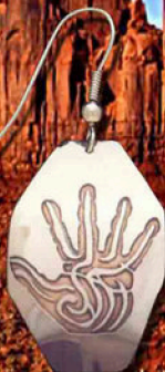
PG08NC Shaman's Hand