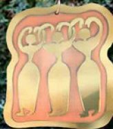
GD10BC 3 Dancing Women