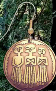
GD07BC Maiden, Mother & Crone